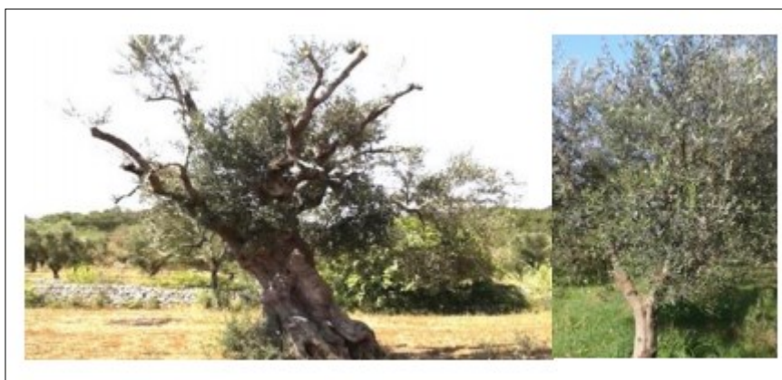
Figure 3. (left) Old olive tree heavily compromised which, after the first cycle of treatments with microbial consortia, has shown a clearly improved resilience and re-vegetation – (right) Younger tree showing and improved resilience to decline after pruning and treatment with consortia containing mycorrhizal fungi and bacteria (see also https://youtu.be/AXdbb4xrImQ ).

have a certain contrast activity against endo-pathogens. Several other different experimentations on the use of microbial consortia on main crops, such as tomato, potato and mais [71] [72] [73], lead to the same assumptions, indicating that the role of a certain microbial consortium is firstly the recovering of the soil vitality, as well as the presence of endophytic strains for contrasting biotic stressors. Beneficial effects were noticed also using a mixture of copper and zinc to form a hydroxyacidic complex with citric acid [74].